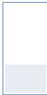
1/3 page 3.6" x 2.8"