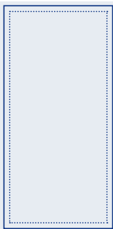
Full Page, with bleed Bleed size 4.4" x 9.4" Live area 3.6" x 8.6"

Safety: Keep all critical text and graphics 0.25 inch from all edges